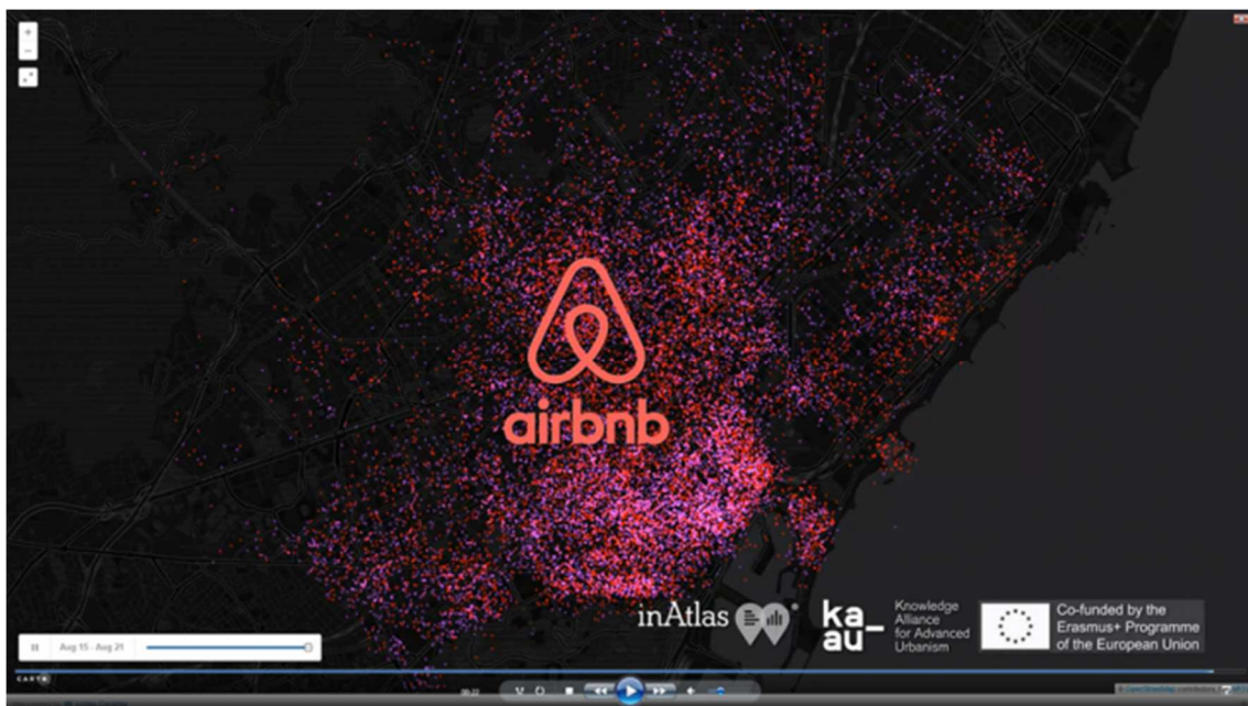
Airbnb apartments and rooms in Barcelona. One year offer rotation in the city of Barcelona. inAtlas. 2016

It will be proposed a defined platform conceptualization from which they will be able to critically work on.